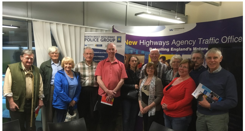
Members and family members at the Northwest Highways Agency Control centre in Newton-le-Willows