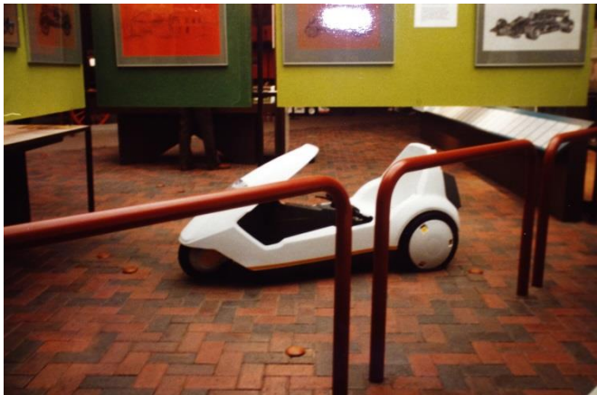
C5 with a flat tyre in a Birmingham museum - 1986

Despite optimistic sales forecasts only 14,000 C5s were made before production ceased in August 1985. Of those only 5,000 had been sold.