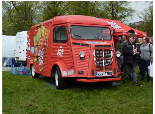
And what is wrong with this picture? According to the DVLA this van is grey!

If you did go out to watch the race I hope you enjoyed it. It is a bit of an anti-climax having waited for several hours for the competitors to rush past in a few minutes but the atmosphere and enthusiasm of the spectators was phenomenal. It also helped that the weather was good over the three days of the event.