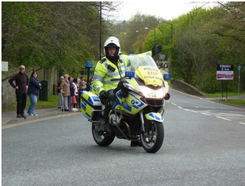
One of the many police motorcyclists who rode ahead of the competitors to clear the route.