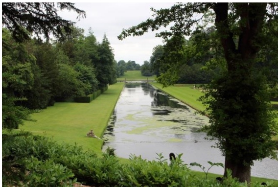
Part of Studley Royal Water Garden

For the return journey I followed the satnav which took us on a longer but I assume faster route along the motorways, not a route I'd necessarily have chosen. I think I'll need to check the satnav settings as it can offer three alternative routes. Another test is to compare the built in satnav with the Tom Tom unit I've been using for the last few years. It's also worth remembering that satnav will take you to the postcode you enter as it's easy to get two characters transposed or select an adjacent character especially on a small touch screen. Then it's a case of realising that you are not where you should be and working out what went wrong!