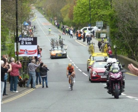
Lizzie Deignan (nee Armitstead) ahead of the pelaton with 2km to go

Following last month's item on the Tour de Yorkshire I've received more pictures of the race from Lesley Pollard. These were taken on day 2 (Saturday 29 th April) close to the finish of the ladies race in Harrogate.