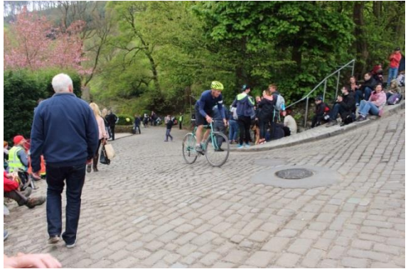
Our viewing spot two hours before the race arrived

The race was due around 3pm so we arrived at 10:30am to be sure of getting our chosen spot. There were about 20 people around the corner when we arrived, there were a few more by 3pm!