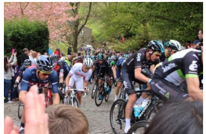
Followed by the pelaton

As 3pm approached the preceding cavalcade of motor bikes and cars heralded the arrival of the competitors. Like the amateur cyclists not all the support vehicles cleared the bend without stalling, it's a first gear bend at the