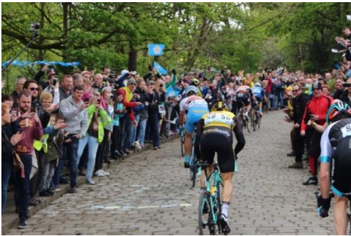
The leading riders climbing the hill

best of times. Then the six leading riders passed without incident followed by the many support cars. A few minutes later the pelaton arrived. With the number of closely grouped cyclists it's incredible that there were no incidents as they rode around the bend which is more than can be said of one of the following motor bikes. It fell over right in front of us blocking the road for a few minutes until one of the support vans came to the rescue. That was when I discovered that the support vehicles not only have