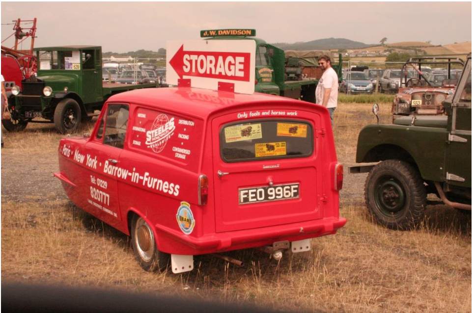
Only Fools and Horses – Northern Branch