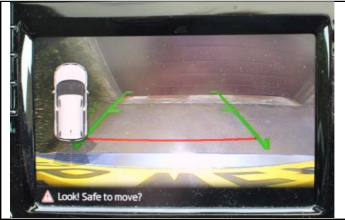
Reversing view camera on my car showing markers at 40cm, 1m & 2m

A more recent development is a camera, mounted on the boot lid/tailgate and activated when reverse gear is selected, which shows the rear view from a perspective that the rear view mirror and door mirrors cannot show. Often the view shown has markings superimposed to show how the position of the car relates to the view.