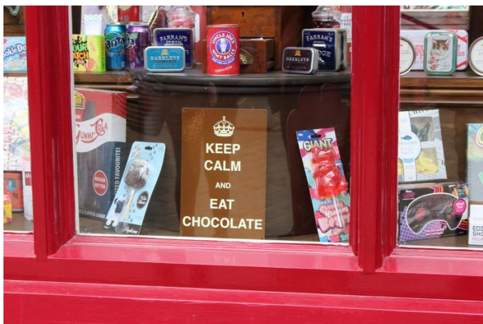
Spotted in a shop in Haworth.