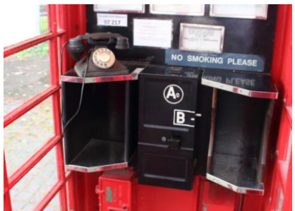
Press button B to see if anyone has left any money on the phone!

Most of the buildings in the museum have been brought to the site but ironically the one building that was originally on the site is not open to the public.