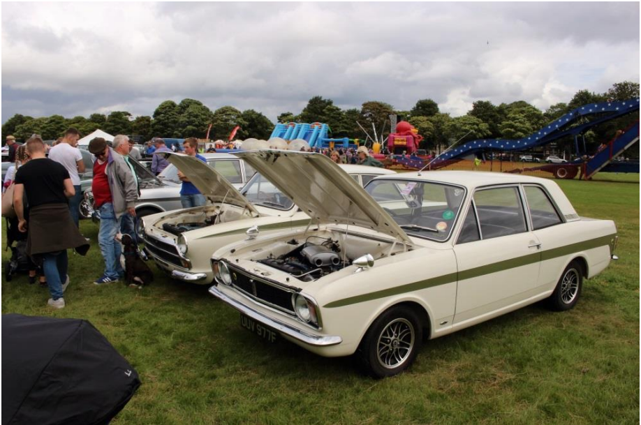
A couple of Lotus Cortinas seen at the Halifax show

So what do you think of driverless cars? There are many unanswered questions, who is responsible for "driving" the car? Is it someone in the car or the engineers that wrote the software? How would they cope with unusual situations on the road? The accident with the Tesla was apparently due to the system failing to see a truck that crossed in front of the car confusing the light side of the trailer for the sky.