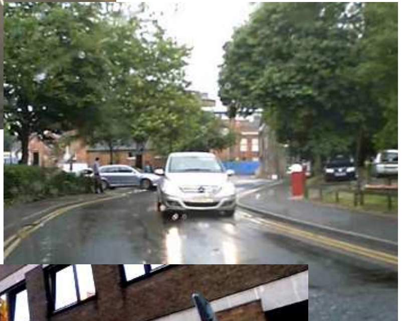
Photo 2 Answers: Wet road conditions, busy car park entrance on the left with a car and pedestrians either side, junction at the end of the road?! Can you spot more?

Photo 1 Answers: Cars in front braking and turning left, junction ahead busy– lorry, one lane of tidal flow closed. Can you spot more?