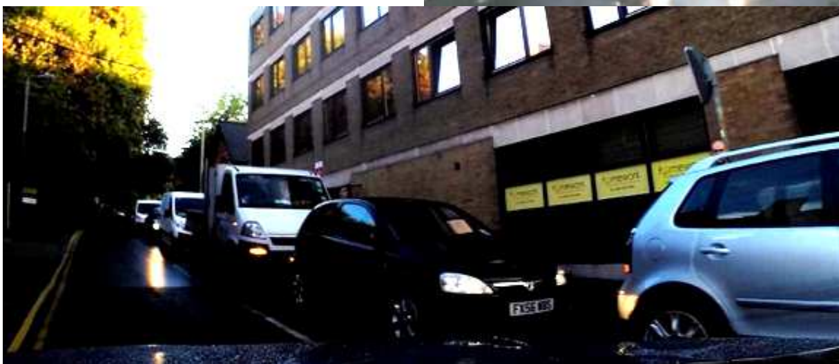
Photo 3 Answers: 2 pedestrians about to cross the road between the cars, driveway further up on the left. Can you spot more?

Photo 2 Answers: Wet road conditions, busy car park entrance on the left with a car and pedestrians either side, junction at the end of the road?! Can you spot more?