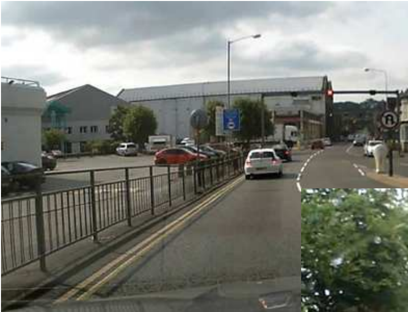
Photo 1 Answers: Cars in front braking and turning left, junction ahead busy– lorry, one lane of tidal flow closed. Can you spot more?