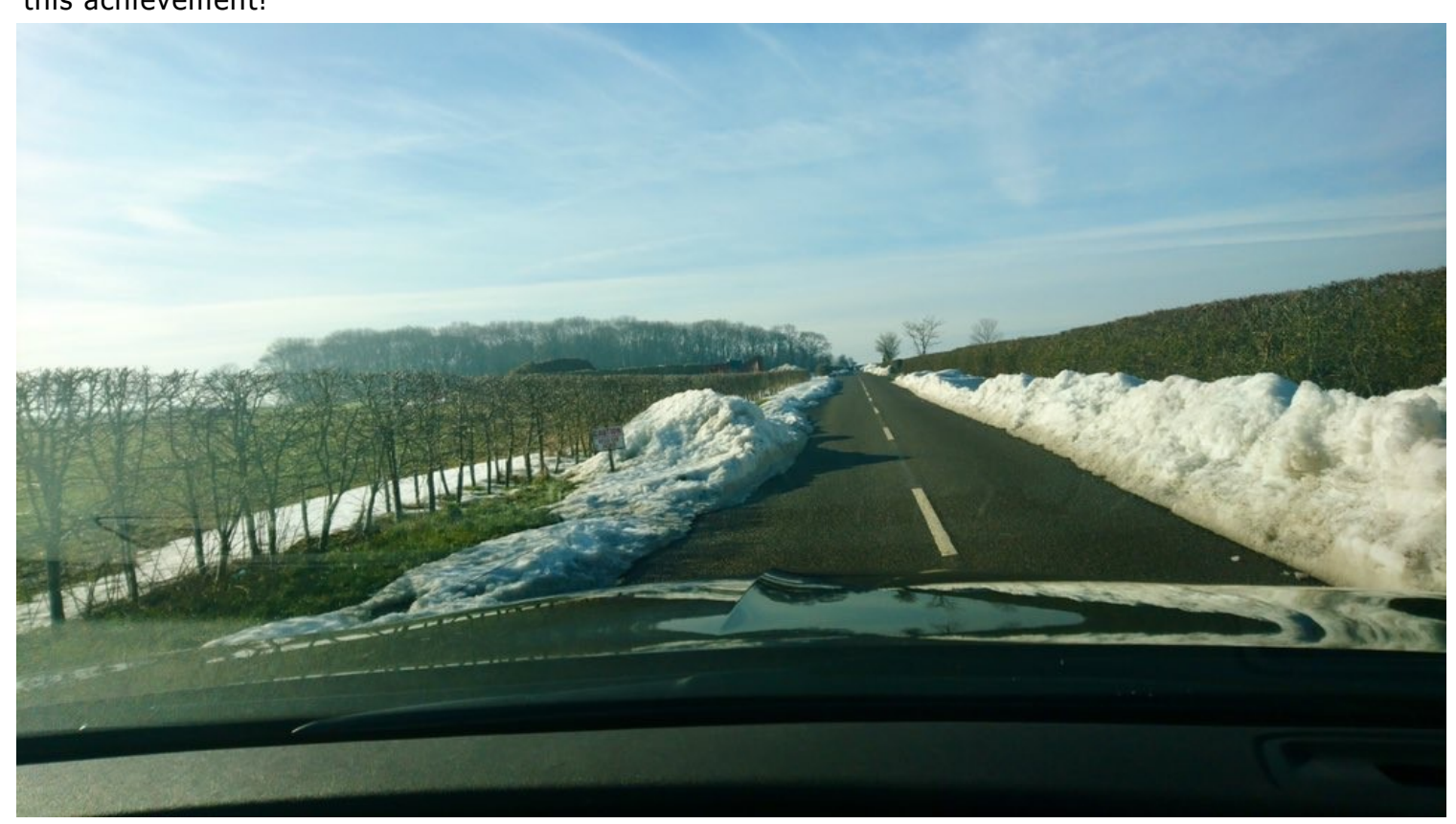
There's still time for winter... are you prepared?

Contact US... something you'd like to share in the newsletter?